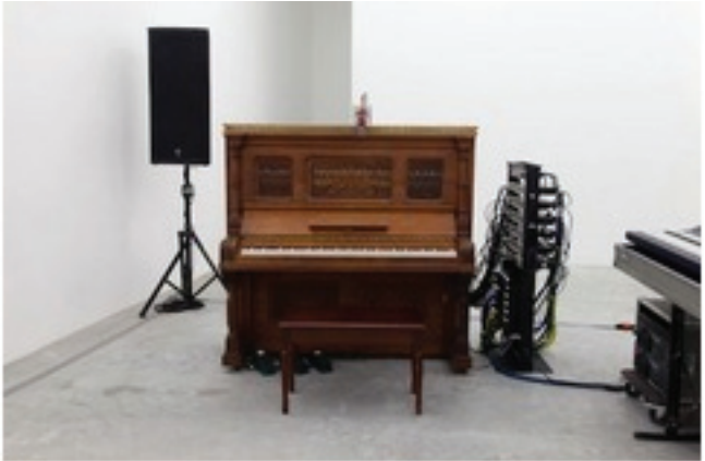
Kevin Beasley, Movement IV , 2015, mixed media, dimensions variable.

To be among Kevin Beasley's new sound installation, sculptures, and photographs is to negotiate a doubled sense of "here"—both the physical recognition of oneself, and the claim for recognition evoked by discarded materials, bound and shellacked in polyurethane, their histories unknown but deeply felt. In Beasley's debut at Casey Kaplan, these contradictory present-tense sensations come together in circular wall-mounted acoustic mirrors cast from satellite dishes. In Untitled (Focus Black Boy II) , 2015, Beasley immobilizes an Air Jordan jacket amid outstretched white T-shirts in coagulated coats of resin, taut and transparent as cellophane, yet thickly refracting ambient noise and viewers' wafting conversations.