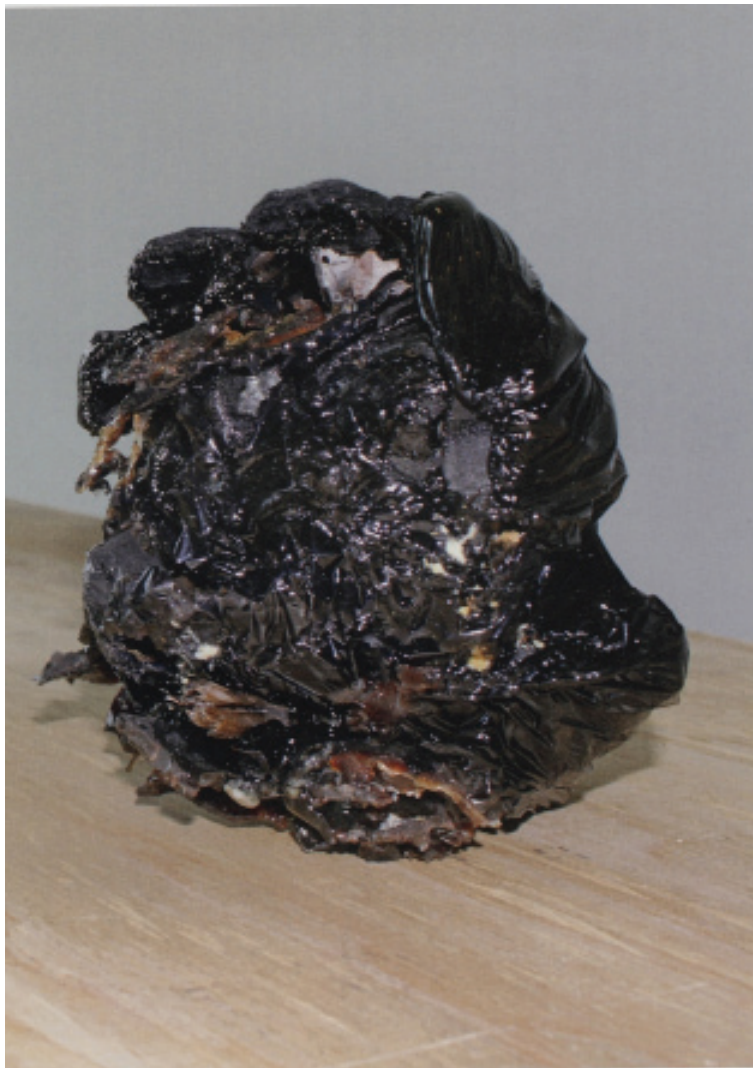
Untitled , 2011. Winter glove, latex, cast resin, peanuts, and polyurethane foam, 7 x 7 x 8 in. (17.8 x 20.3 cm)