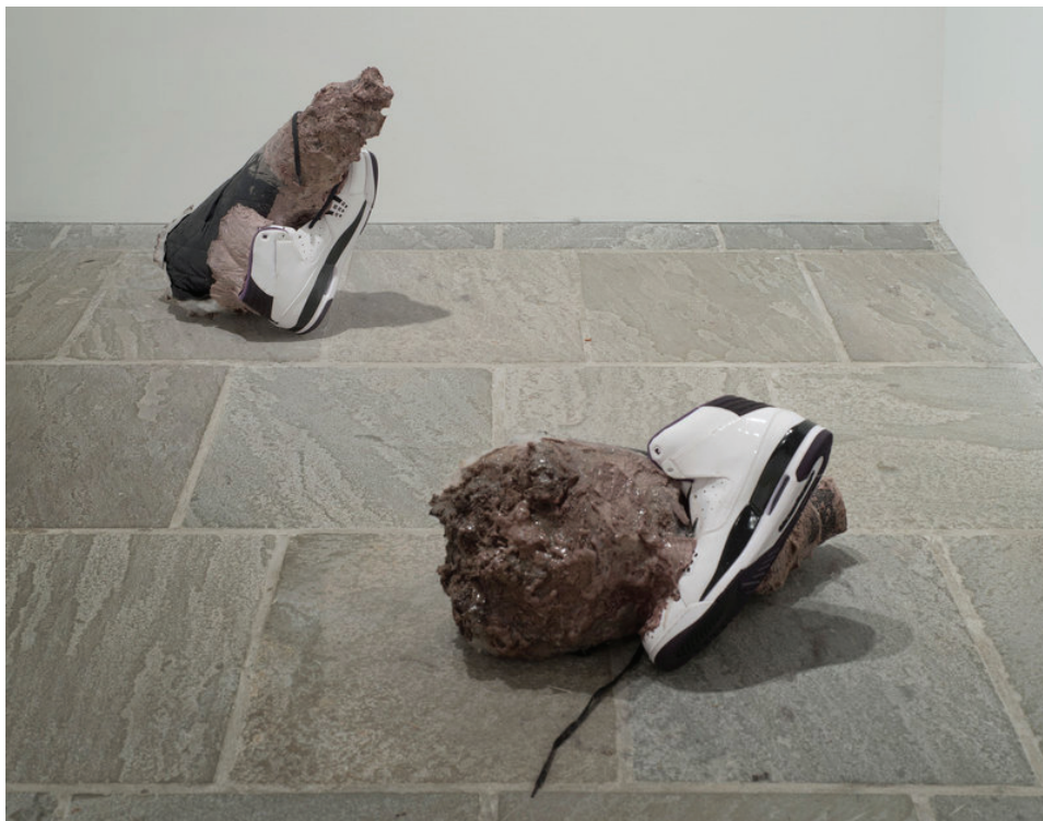
Kevin Beasley, Untitled (Jumped Man) , 2014. Whitney Biennial 2014, Whitney Museum of American Art, New York, March 7- May 25, 2014. Collection of the artist.

DJ: I've changed my opinion on that quite a bit over time. When art moves outside of its own context it loses some of the power that is sustained through its connection to art institutions. The desire to go outside that context is also an implicit statement that the art world isn't a place where power relations exist in a material way. In After Art , I argued that, while the art world in fact shouldn't be elided with the world of enterprise or politics, it is in fact a realm of enormous cultural and economic power. Paradoxically, it seems to me that standard Institutional Critique has all but drifted away from engaging with the terms of the actual institutions that support art right now — in part because such critique has found such a welcome place in museums and galleries. The most potent examples I can recall in recent years have interrogated the conditions of labor for art handlers, or for the builders of museums and universities in the Persian Gulf. I wonder if a more productive mode than Institutional Critique is what the DIS collective is doing — which is to mobilize a potentially new model instead of critiquing existing ones. That seems to me ultimately where the future lies.