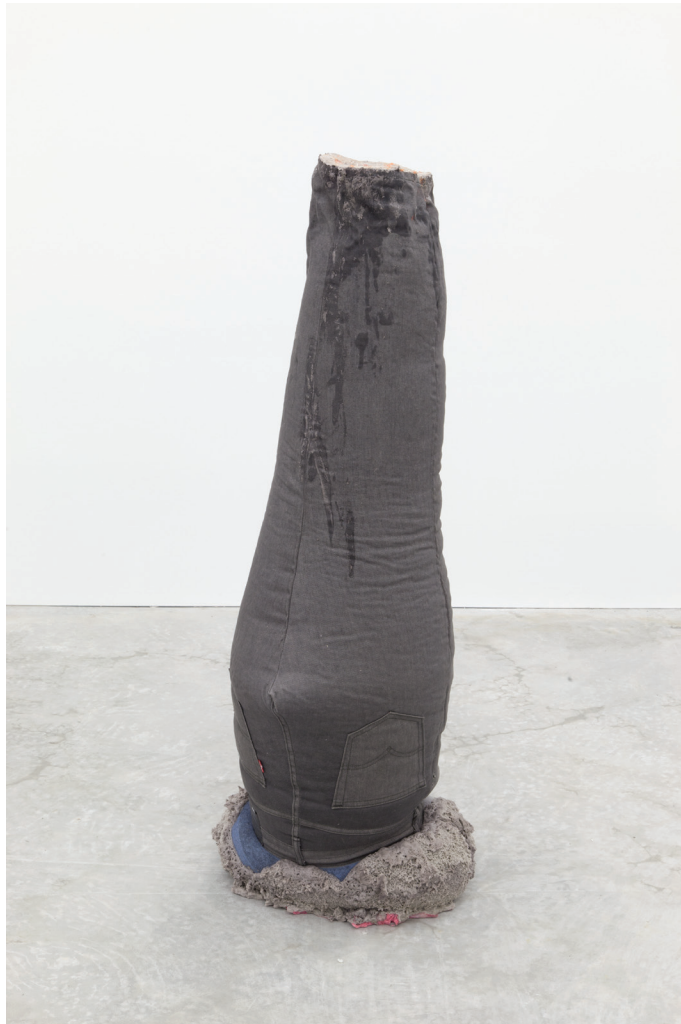
Kevin Beasley, Untitled, 2015, Polyurethane foam, resin, grey jeans, underwear, studio debris, 47 x 17 x 20" / 119.38 x 43.180 x 50.80 cm, photo: Jean Vong, Courtesy of the artist and Casey Kaplan, New York