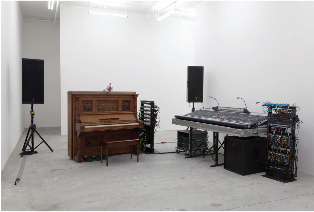
Kevin Beasley, Movement IV, 2015, Vintage Steinway piano, mixing console, effects processors, di-boxes, speakers, cables, 61 x 28 x 28" / 154.94 x 71.12 x 71.12cm, 30 x 20 x 14" / 76.20 x 50.80 x 35.56cm, 89 x 42 x 16" / 226.06 x 106.68 x 40.64cm, photo: Jean Vong, Courtesy of the artist and Casey Kaplan, New York