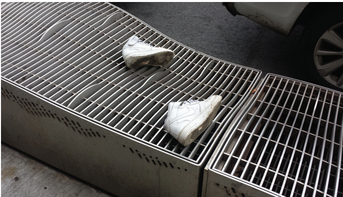
Untitled (Queens, NY, November 21, 2013), Photograph.

The Whitney performances were the first time I felt like I was really conscious of my body and my movements because I was relying so much on them. I felt really vulnerable because there are so many precedents for using your body in that kind of space.