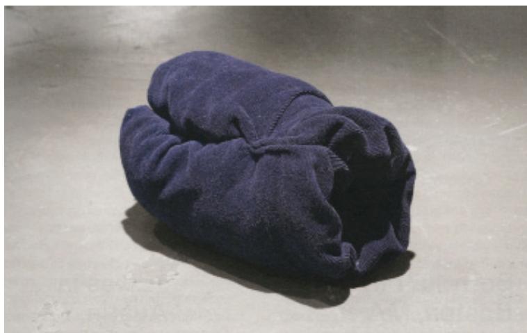
Your Awaited Evening , 2010. Bathrobe and latex, 12 x 7 x 8 in. (30.5 x 17.8 x 20.3 cm)