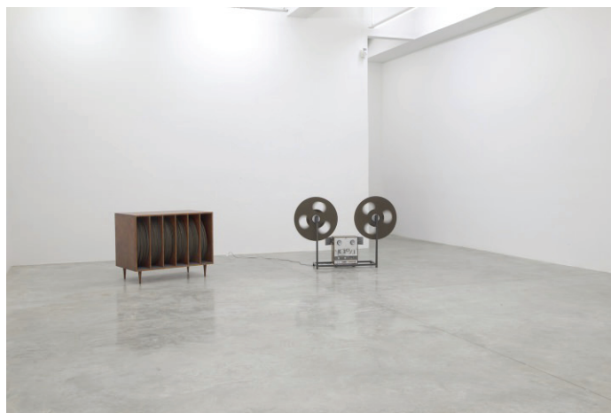
Kevin Beasley, ...for this moment, this moment is yours... , 2013 Courtesy of the artist and Casey Kaplan, NY

The project is comprehensive in its interrogation of these physical qualities, and Beasley uses different types of microphones as ways to explore different sides of this dynamic. "Each one has their own particular way of picking up sound or picking up vibrations," he says. "This one has a contact mic in it, this one has a hypercardioid microphone in it so it kind of tunnels all of the sound. This one is two microphones—you know when you're holding a microphone and your rubbing your hands on it, it picks up that noise, it picks up the sounds of the actual device. They operate kind of like contact mics. But you can also hear a slight ghost of what's happening in the space." In his loosely scored performances he plays each of these sculptures like an instrument in a way that feels like he's trying to exhaust their potential. He later talks about the connection back to how this helps him understand the bodies that inhabit the space: "I think about the condition of a body," he says. "How do we socially