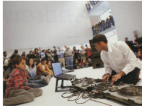
I Want My Spot Back , 2012 (installation view, Some Sweet Day , The Museum of Modern Art, New York, October 15-November 4, 2012)

Beasley makes reference to particular and contingent bodies, eschewing illusion and pushing the materials he uses to the limit of their capacity. While his objects and time-based works evolve from experiences in specific places that happen to bear autobiographical relation to where he grew up, attended school, and currently lives (Lynchburg, Virginia; Detroit; New Haven, Connecticut; and New York), they refuse personal representation, save for the traces of their ongoing formation. Emerging from ready-made materials and everyday beats, the artist's materials are returned- assisted, remixed, and worked over- now rendered unfamiliar and ambiguous. Through a confusion of material and physical identity—corpse or trash, excess or lack-Beasley draws our attention to the kinds of dislocation, crisis, and doubt that habitually lie before us, quietly asking us to take notice even if we might again look away.