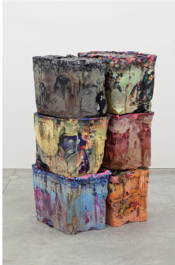
Kevin Beasley, Untitled (stack) , 2015, Polyurethane foam, resin, soil, house dresses, t-shirts, studio debris, soil, 48 x 27 x 20" / 121.92 x 68.58 x 50.80cm, photo: Jean Yong, Courtesy of the artist and Casey Kaplan, New York

relevant? The artwork almost always contains vestiges of what might be called the roots — or infra-structural extensions — of its entanglements in the world. These might include the means of production of the image, the human effort that brought it into being, its mode of circulation, the historical events that condition it, etc. The artwork's format solidifies and makes visible that connective tissue, reinforcing the idea that the work of art encompasses both an image and its extensions. The term format does not merely distinguish between digital vs. analog, as medium might do, but points to how an image is situated within a set of relations that condition how efficacious it may be. Formats attract attention and exercise power. The difference between format and medium lies largely in the heterogeneity of the components — aesthetics, data, history, the scene of an action — which is anathema to traditional concepts of medium. When Bruno Latour talks about assemblages, he is talking about linkages — not the abstract infinity of a network. It's difficult to quantify the limits of extension, for instance, one must think about what is folded into images as well as what extends out from them.