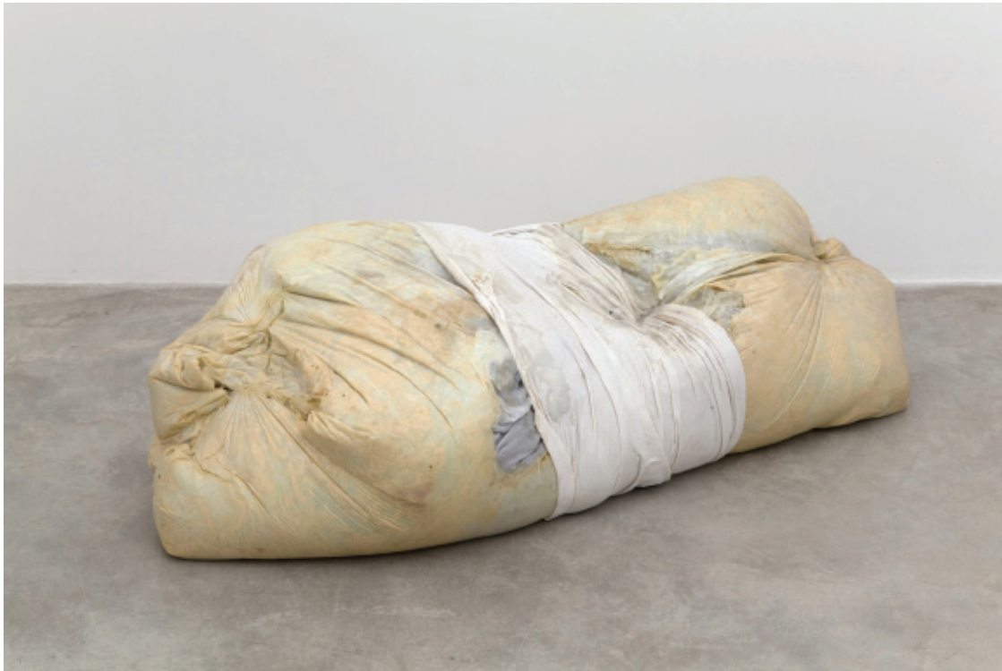
Untitled (Sack) , 2012. Foam, resin, T-shirt, mattress cover, cotton, and thermal shirt, 51 x 23 1/2 in. (129.5 x 58.4 x 40.6 cm)

The white T-shirt-stretched taut over a transparent mattress cover, a thermal shirt, and polyurethane foam-bears an uncanny resemblance to its original function: the stitches and seams along the object's side would have once withheld an armpit from view. Stretched and removed from the body of its previous owner, the hole is one of Untitled (Sack) 's several allusions to the gaps and folds out of which the sculpture's contents seep through and reveal its holdings. The hardened resin that gives these extrusions their luster also makes the object look wet, as if it were recently produced or a point of entry or refusal. At 4 feet in length, Untitled (Sack) (2012), is anthropomorphic in scale, and its compressed form resembles a body bag. The shirt's threads construct a barrier between the unknown, bounded form beneath and the viewer; like the armpits it housed before, the shirt fails to fully withhold the found and used materials that it struggles to encase.