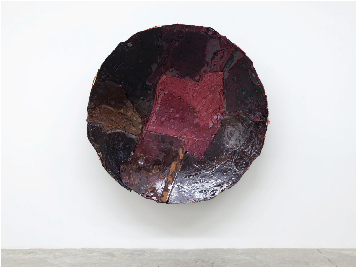
Kevin Beasley, Untitled (Focus Black Boy I) , 2015, Resin, wood, t-shirts, television mount, 70 x 70 x 16"/ 177.8 x 177.8 x 40.64cm, photo: Jean Vong, Courtesy of the artist and Casey Kaplan, New York

DJ: Yes. I think that art has always been able to constitute spaces and publics that were not necessarily anticipated by its makers or commissioners — this is part of what I mean by art’s futurity. I think that seeing images of Apartheid, for instance, made a huge difference in mobilizing opposition to that system outside of South Africa. South African photographers addressed not just their own communities through their work, but the world, and this allowed pressure to be exerted from outside. If we live more and more in images, images attain more and more new powers. The question is how to experiment with such power, how to learn to use it for something other than accumulating capital.