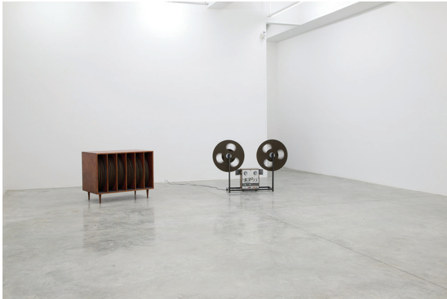
Installation view. . . for this moment, this moment is yours . . . 2013, wood, cassette tape, Akai x-1800SD reel-to- reel player and mixed mediums.