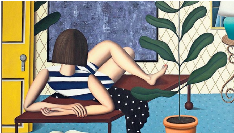
Jonathan Gardner's 'Interior Landscape' (2015)

Show traces ways in which the human form is reconfigured within the decorative, the diagrammatic, in styles folding together disparate influences