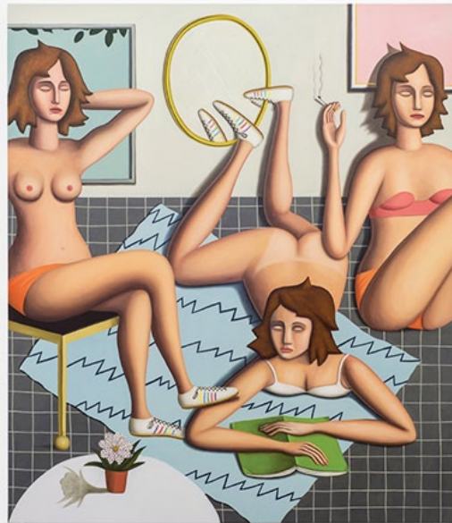
Zig Zag, 2014, oil on canvas, 1.5 x 1.3 m