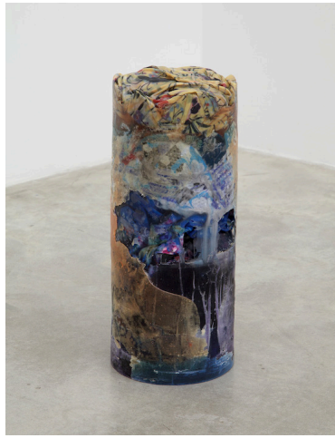
Kevin Beasley. 'Katie's', 2014. Resin, altered carpet, muumuu dresses.